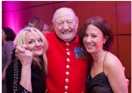
One of the Chelsea Pensioners with Charity Gala Dinner guests in February 2014