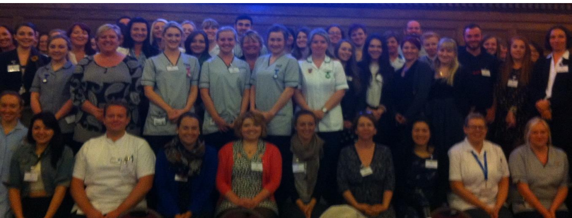
Students' Day attendees from across the UK in May 2014