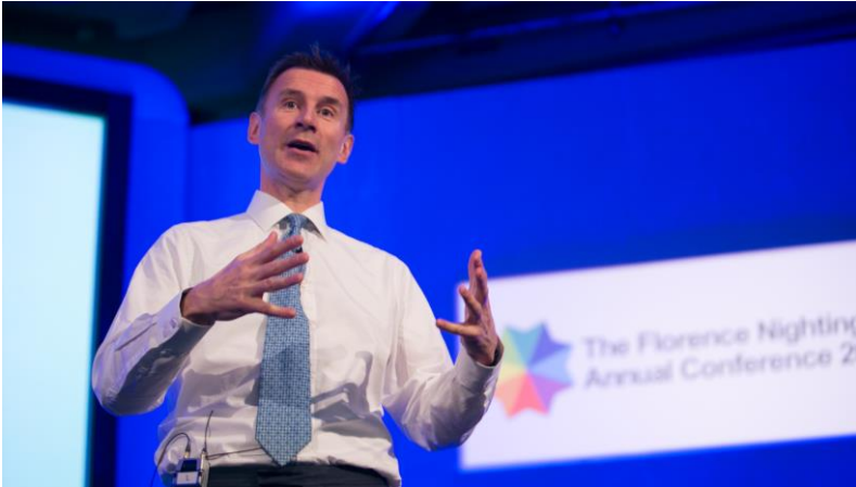
The Rt Hon Jeremy Hunt MP, Secretary of State for Health at the Florence Nightingale Foundation 5 th Annual Conference 2015